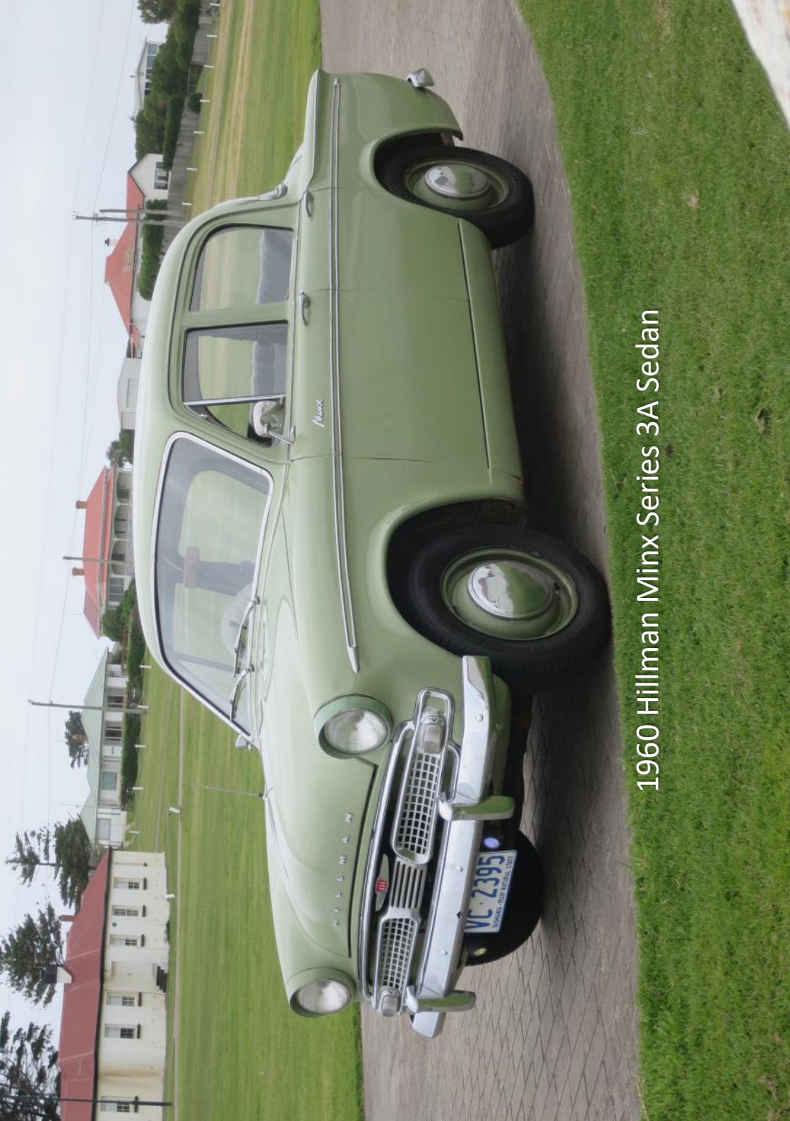
1960 Hillman Minx Series 3A Sedan